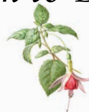
Fuchsia by Toni Ross

For information, visit the exhibit website: www.tamaraclark.com/gnsine/highfield.html or highfieldhall.org