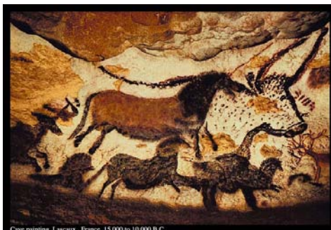
Cave painting, Lascaux, France, 15,000 to 10,000 B.C.