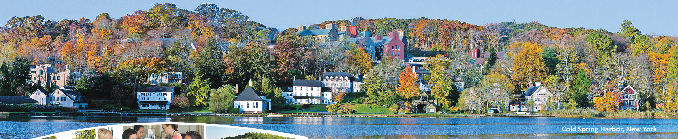
Cold Spring Harbor, New York

March 29 - April 11, 2017 Applications Due: January 6, 2017